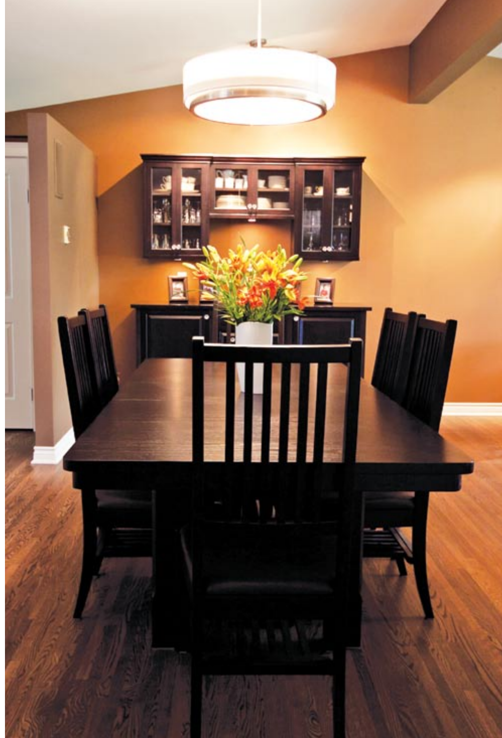
PICTURED TOP Plans included gutting the main floor to open up the existing L-shaped living room/dining room/kitchen area. A sizeable addition with full basement was added to accommodate a new large kitchen and huge mud room on the main floor with more bedrooms in the basement.